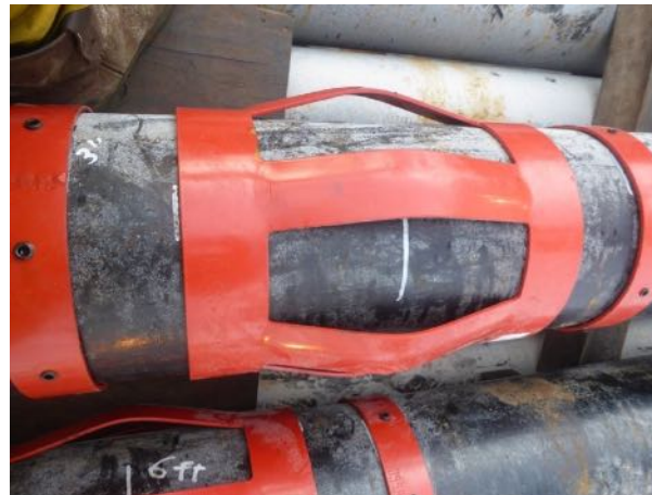
S2 centralizers and 00SO stop collars installed and ready to go downhole